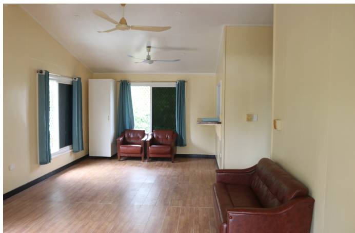
Spacious living room installed with white and brown goods

The acquisition of the Cook Street duplex marks another positive step for Wai Tri Holdings as it strengthens its presence in property investment and continues to build long term value for its beneficiaries.