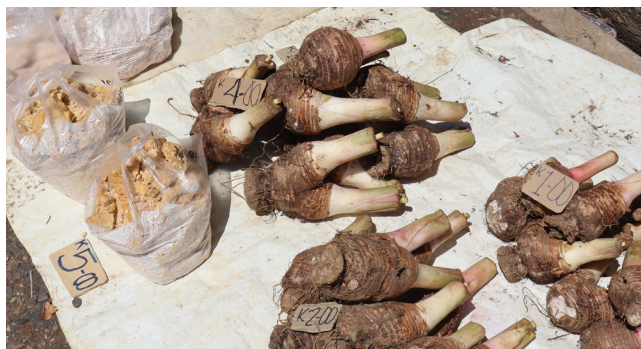
Taro combs sold for K2 and K4 each at Kiunga Town market

Across the Western Province, particularly within the Community Mine Continuation Agreement (CMCA) region, OTDF continues to play a vital role in strengthening agriculture as a pathway to food security and income generation. Through the provision of planting materials, farmer training, extension services, and market linkage support, OTDF is helping communities build resilient livelihoods, reduce poverty, and contribute meaningfully to long-term development well beyond the mining era.