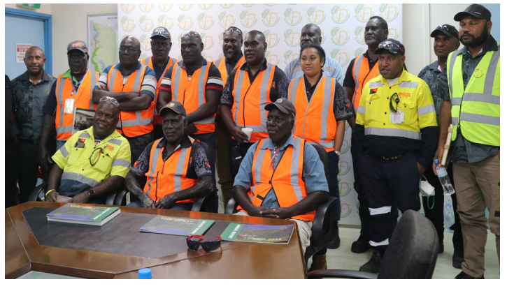
Bougainville group visit OTDF in Kiunga