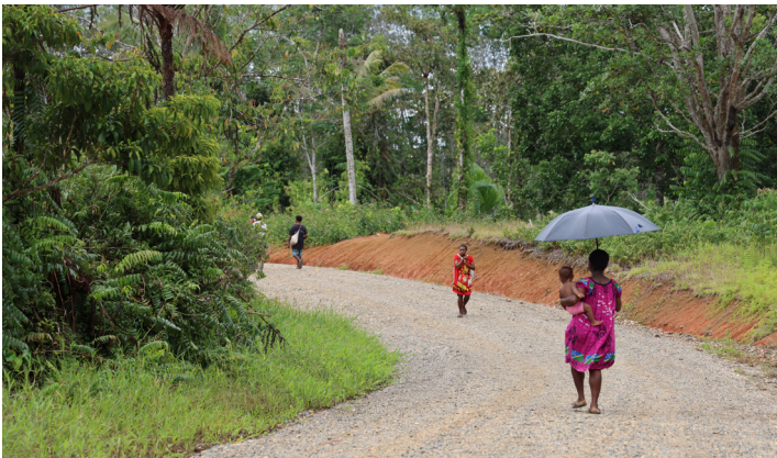
Demesuke road rehabilitation project complete