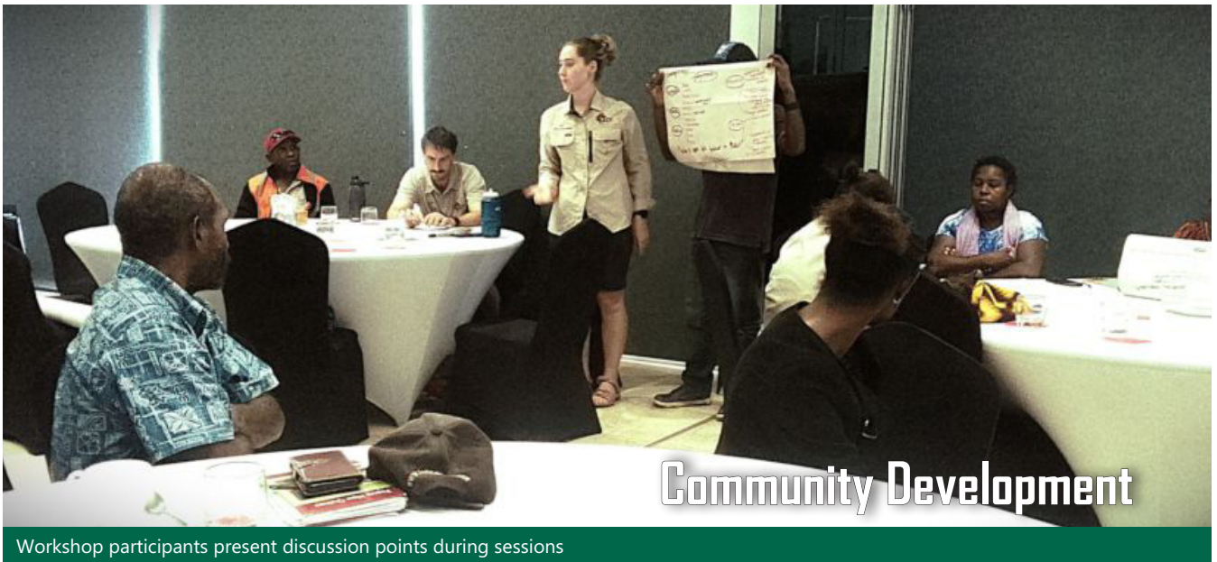
Workshop participants present discussion points during sessions