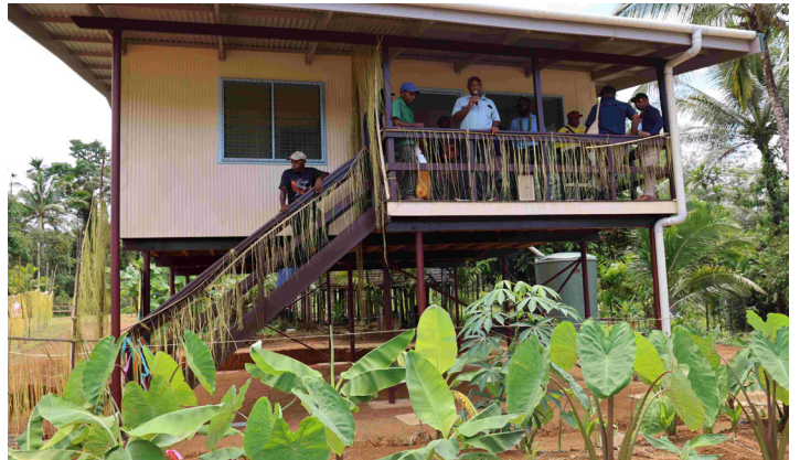
Infrastructure development for CMCA communities in NF continues