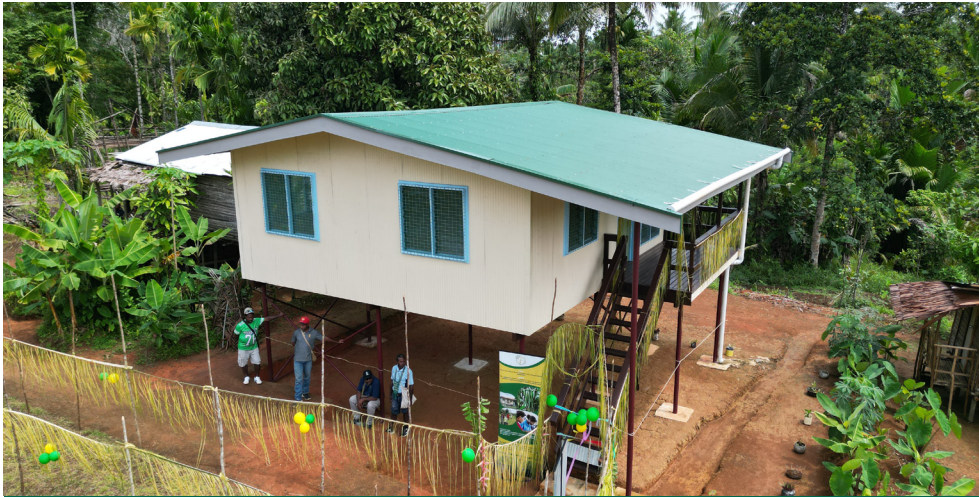
One of the homes in Demesuke village built for off-grid living