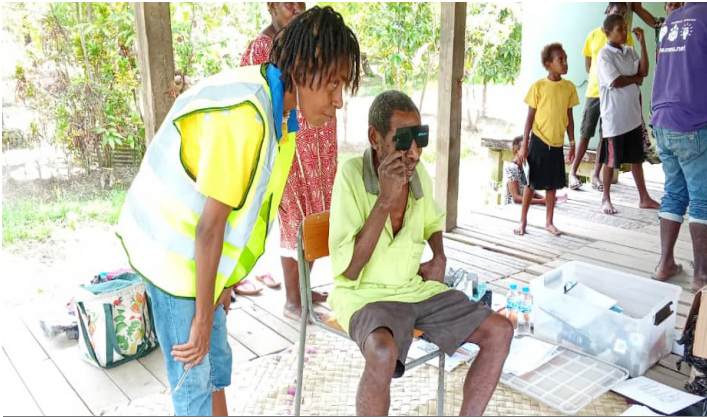
Manawete W&CA provide support for people with special needs