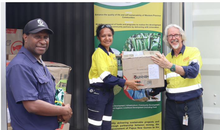
OTML partners in Australia donate WaSH Hygiene Kits for Western students