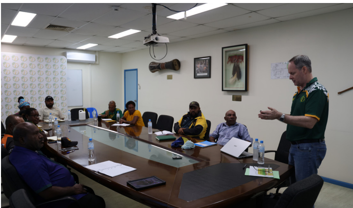
Planning sessions for the OTDF new way forward (SBP 2026-2033)