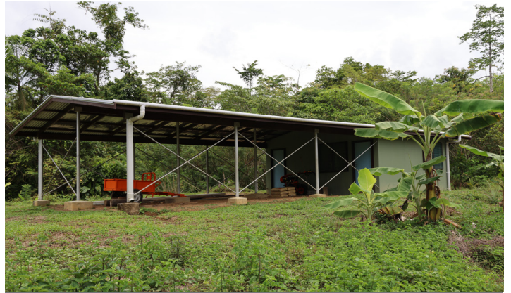
CSBC buildings across CMCA region used for crop distribution to farmers