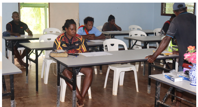
Matriculation students sit for mock exams in Tapila, South Fly

The renewal of the agreement marks a significant milestone in advancing inclusive education in Western Province. Both OTDF and PNG UniTech reaffirmed their shared vision to nurture a skilled, knowledgeable workforce that can contribute meaningfully to community development and Papua New Guinea’s broader national growth agenda.