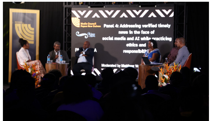
OTDF Media formally recognised as affiliate member of Media Council