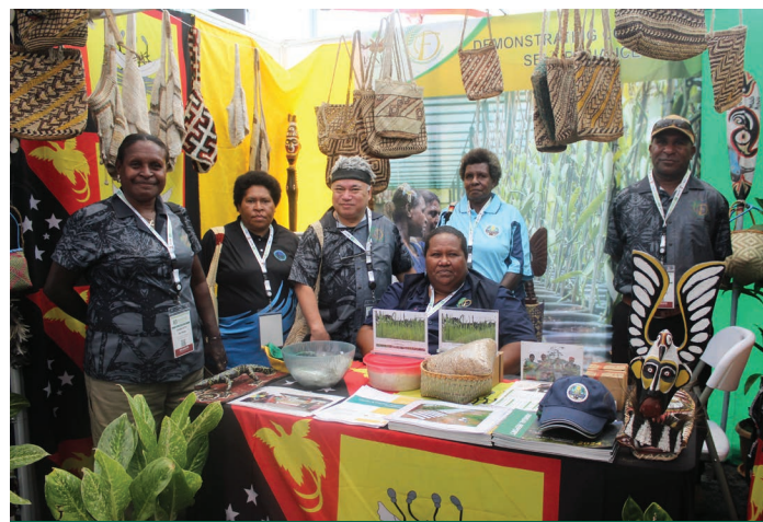
The representing team at the CANCONEX program in Port Moresby

Delegates also identified three urgent priorities: empowering landowner enterprises, ensuring fair benefit distribution, and embedding systems that create lasting transformation.