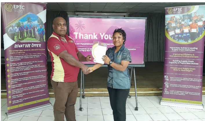
Procurement and Supply Chain Management Training certification