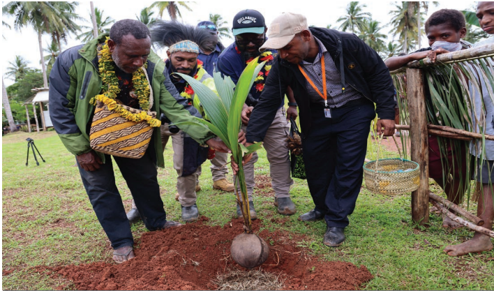
Declaration of a new beginning for Pukaduka 1 village, South Fly