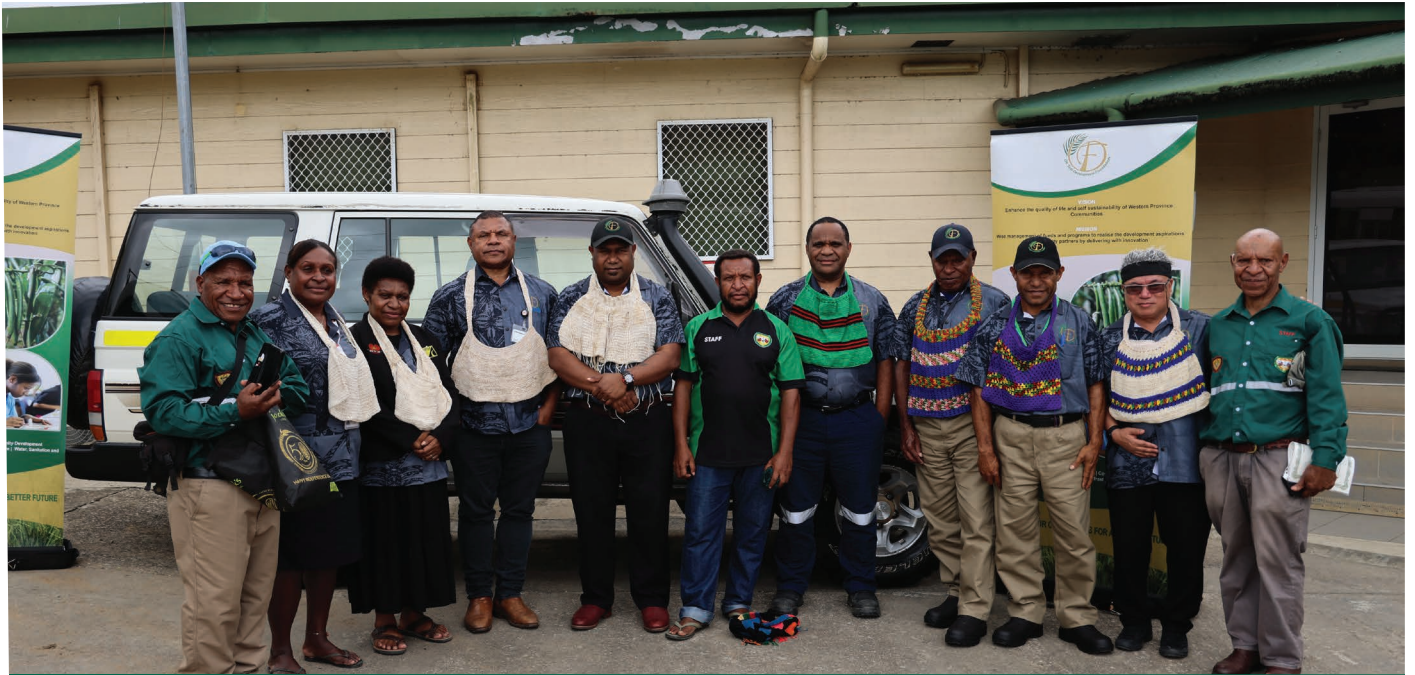
Kiunga Vocational Administration staff receive vehicle donated by OTDF Board & Executive Management