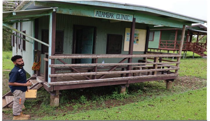
Aiambak clinic inspection for maintenance, Middle Fly