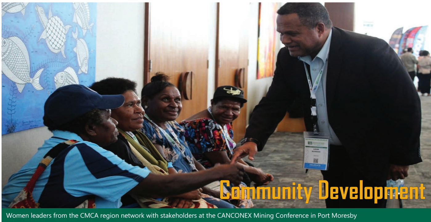
Women leaders from the CMCA region network with stakeholders at the CANCONEX Mining Conference in Port Moresby