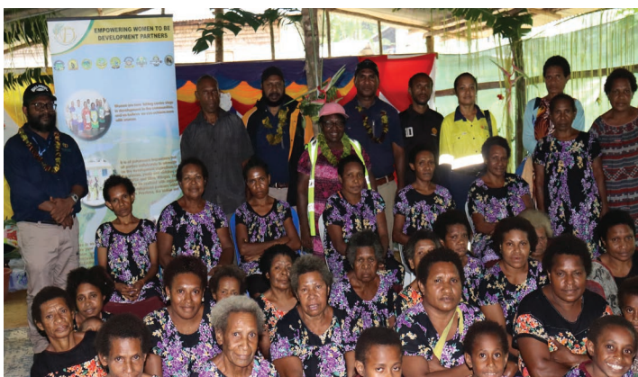
Life Skills Training still a part of the OTDF WNC Program