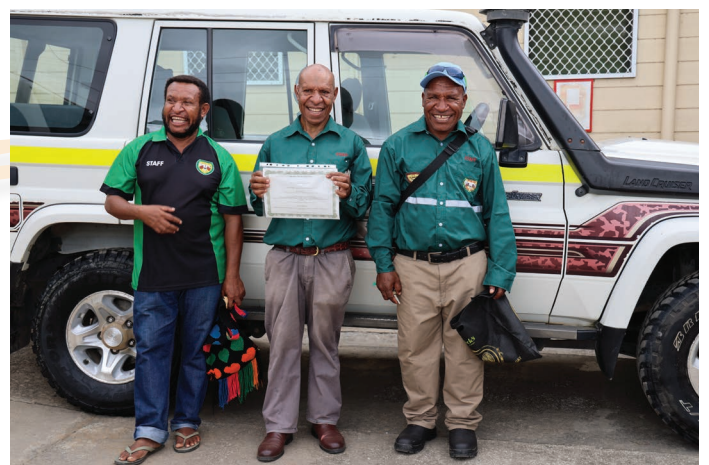
The KVC administration team alongside the Toyota Land Cruiser