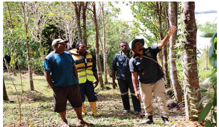
Demo block visit by OTDF LDP team, Kaviapo village Middle Fly