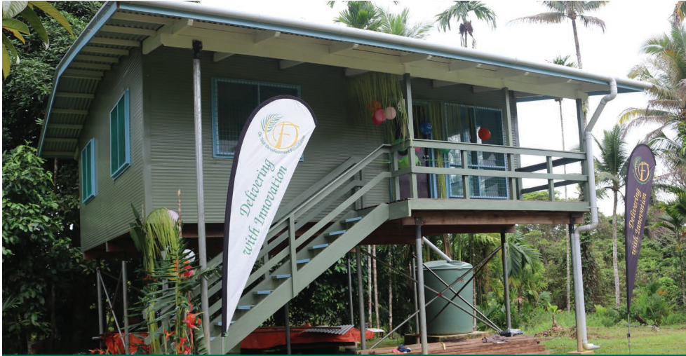
A family home built as a result of the Kawok VPC 5 year Development Plan