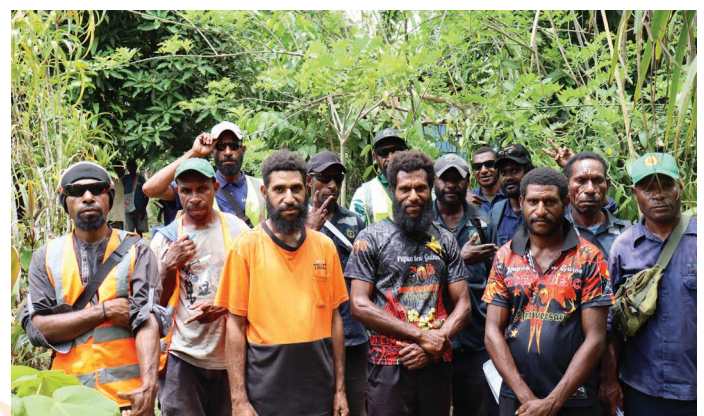
Small holder vanilla farmers receive upskilling in growing vanilla

For OTDF, the Fly Vanilla Project is more than an investment in crops—it is an investment in people, resilience, and the future of Western Province.