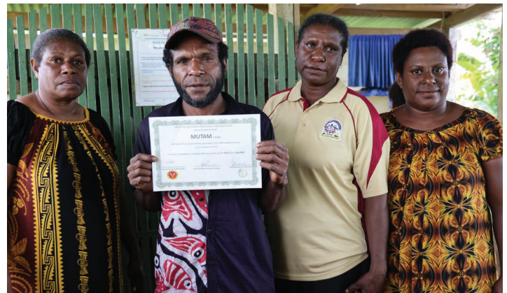
Mutam Village declared Open Defecation Free by WPHA