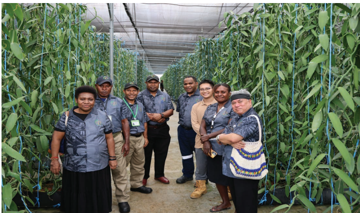
OTDF Board Visit Samagos AIC, Kiunga, North Fly