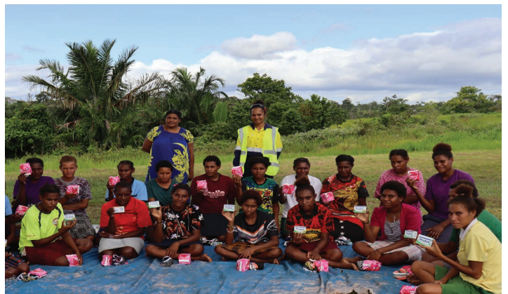
Menstruation Health Management (MHM) awareness, South Fly