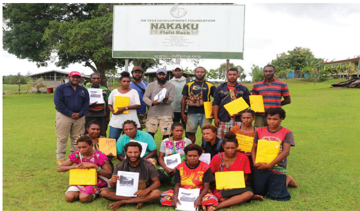
CES delivery of fode materials to students in Suki