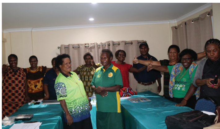
Women Presidents Meeting in Port Moresby