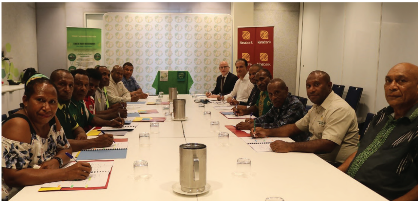
Representatives from the CMCA Trusts, Kina Bank and OTDF