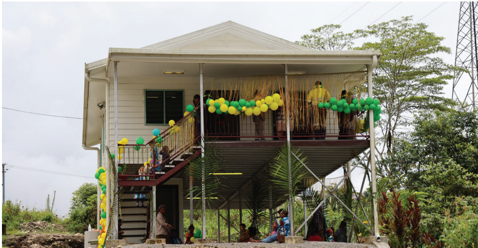
One of the newly built homes at the Kavorabip Kona