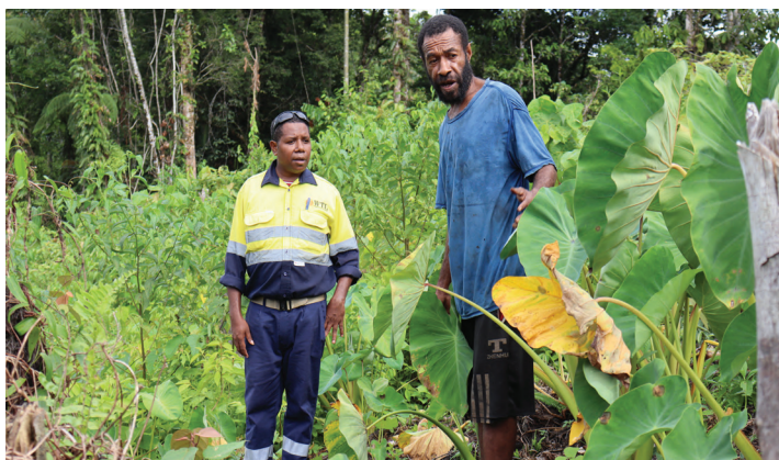
Food Security field visit to Mimingre village