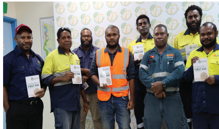
OTDF Staff after completing First Aid Training