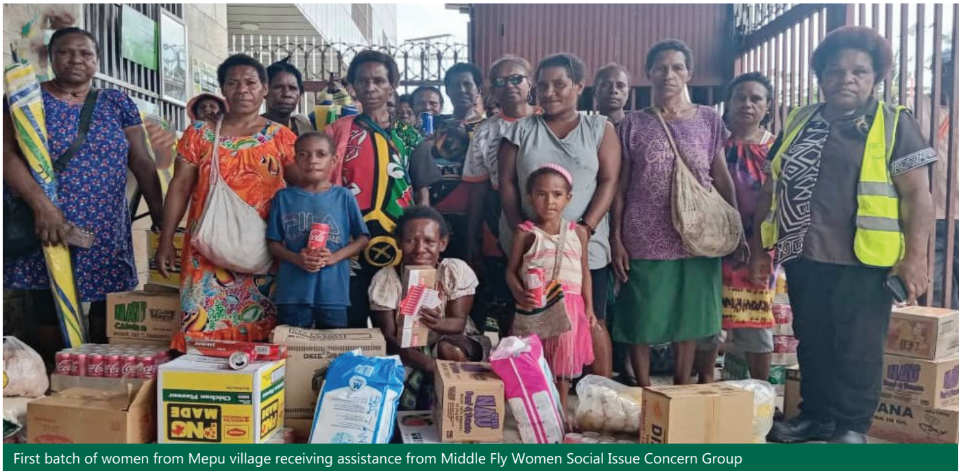
First batch of women from Mepu village receiving assistance from Middle Fly Women Social Issue Concern Group