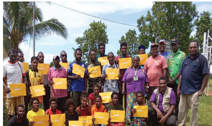
Village Health Assistant(VHA) Training in Tapila