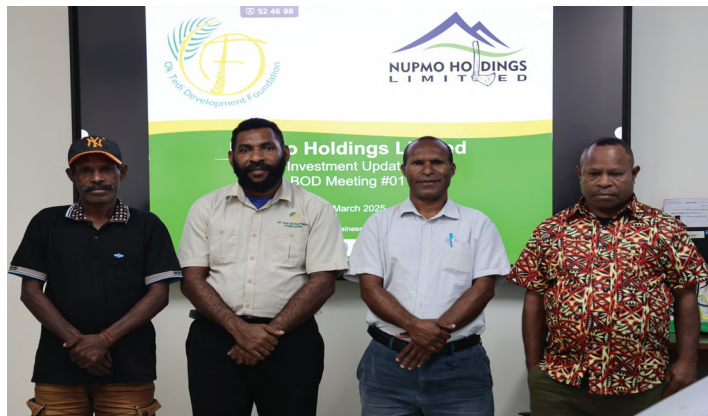
Nupmo Holdings BOD Meeting #1, 2025