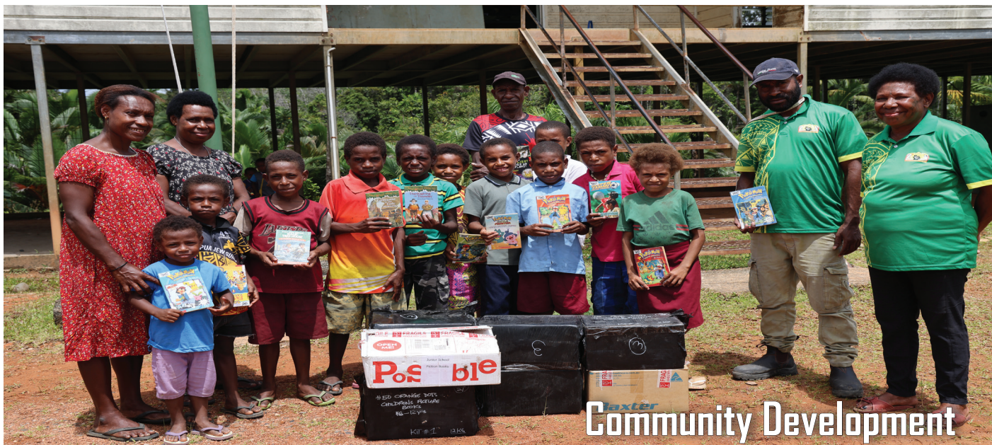
Ilenkenai Community School receive library books