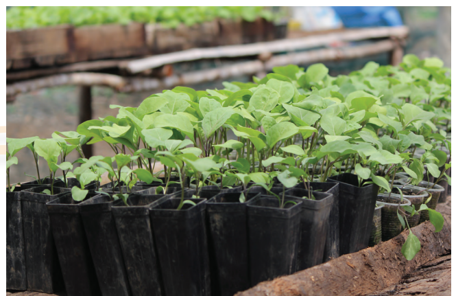
Seedlings in the nursery ready to be transplanted

The project has already inspired interest from within the community, and the youth group is considering running training on sustainable agricultural practices, crop varieties, and possibly livestock in the future.