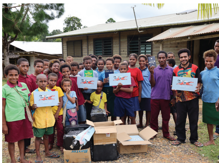
Miasomnai Community School showing the new Library books

By investing in libraries books for primary and community schools, they aim to create an equitable learning environment where every child has the opportunity to thrive.