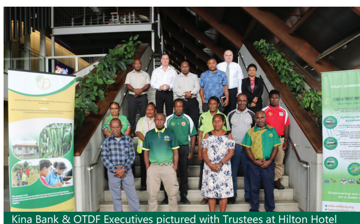
Kina Bank & OTDF Executives pictured with Trustees at Hilton Hotel

This strategic collaboration marks a new chapter in the management of the CMCA Trust portfolios and ensures that the communities of Western Province continue to benefit from prudent, secure, and future-focused investment of their trust funds.