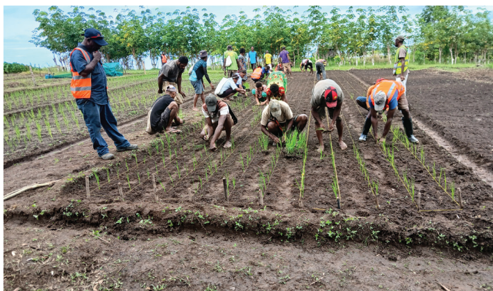
Aiambak rice transplanting demo training