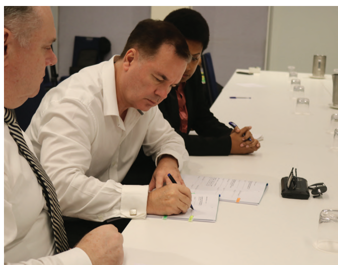
Kina Bank & OTDF Executives pictured with Trustees at Hilton Hotel

The signing marks an important move to secure and grow the CMCA Trusts' assets, ensuring they continue to support development and better outcomes for the beneficiary communities.