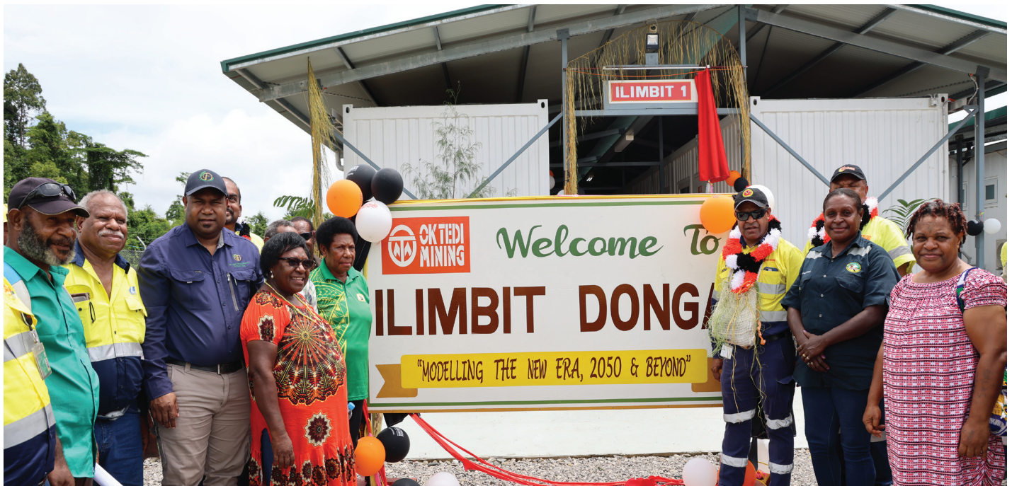
Local investors and partners in front of the new dongas at OTML Bige operations site