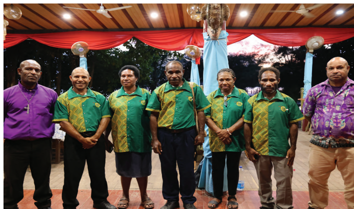
Tutuwe Trust Meeting in Kavieng