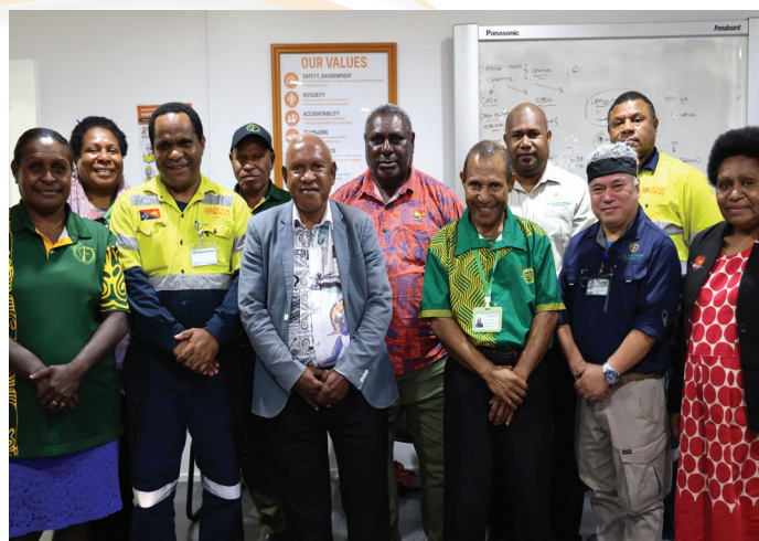
Full forum for the first quarter board meeting

As OTDF advances through 2025, it remains steadfast in its mission: to be leading development partner in improving self-sustainability and the quality of life for the communities of the Western Province.