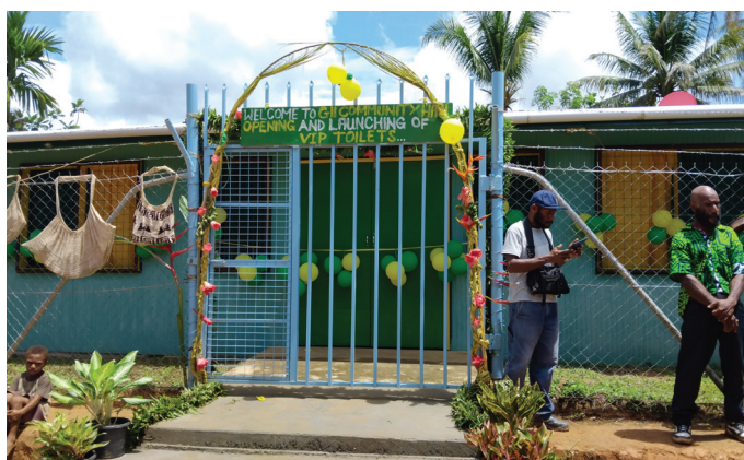
The newly opened Community hall in Gii village

"We thank OTDF for believing in us. These two infrastructures will help us live healthier lives and give us a place to gather, learn, and plan our future." The success of Gii village shows what is possible when communities and partners like OTDF work together with trust and shared purpose.