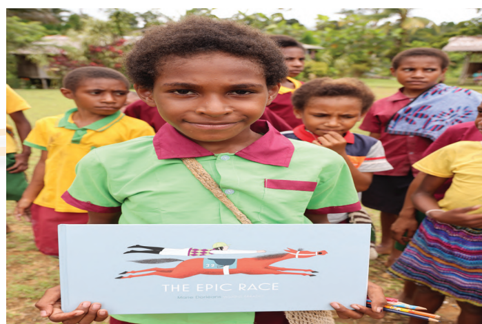
Miasomnai Elementary student showing new reading book