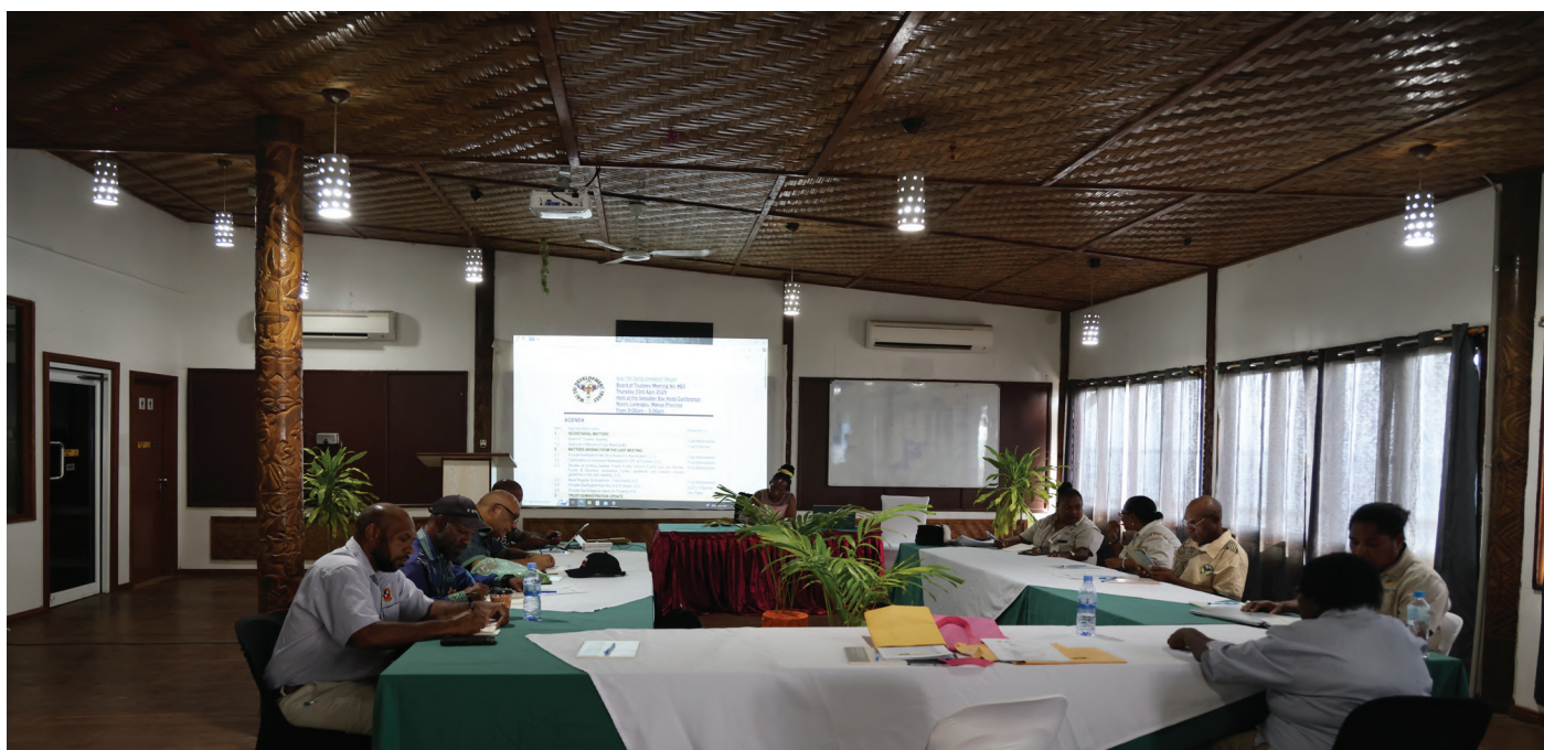
Wai Tri Trust meeting at the Seadler Bay Hotel in Manus