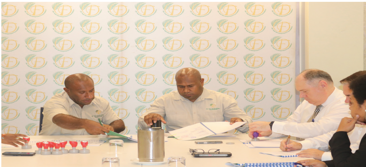
Signing Ceremony of the Custodian Deed at the Hilton Hotel, Port Moresby