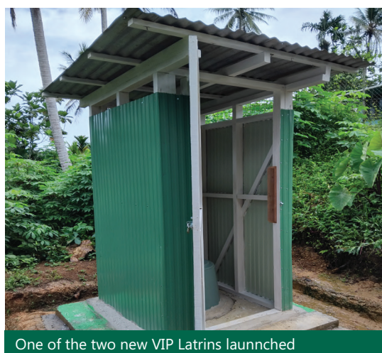
One of the two new VIP Latrins launched