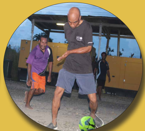
Green Tree striker, using volley technique