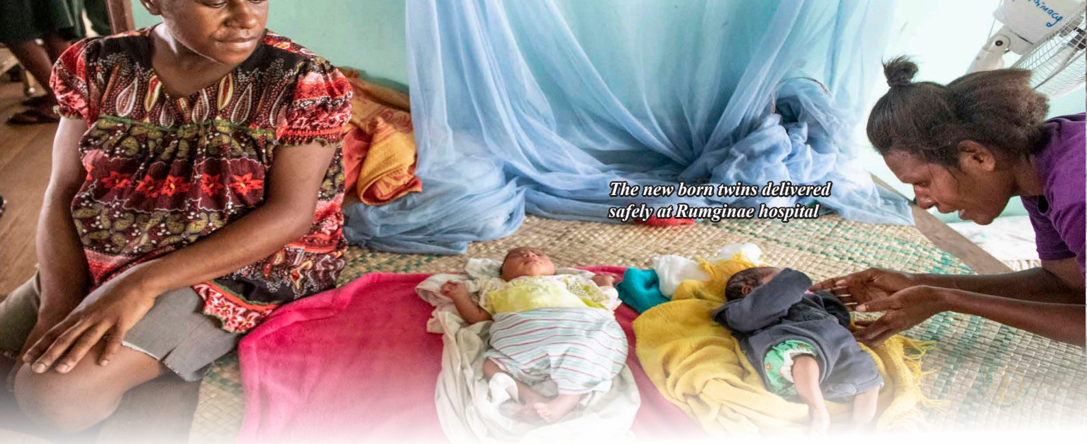
The new born twins delivered safely at Rumginae hospital