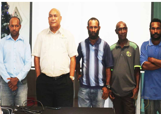
Amidst Covid-19 pandemic, OTDF still continues to support the Trust boards of the CMCA.

A highlight for the year was the awarding of 'Share Certificates' to Ambaga, Birimkamba, Kungim, Komokpin and Kungembit villages of lower OK Tedi region acknowledging their involvement as investors in the land owner company, Upper Lower Ok Tedi Limited.