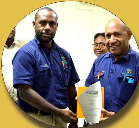
OTDF recognised for contributions to company growth