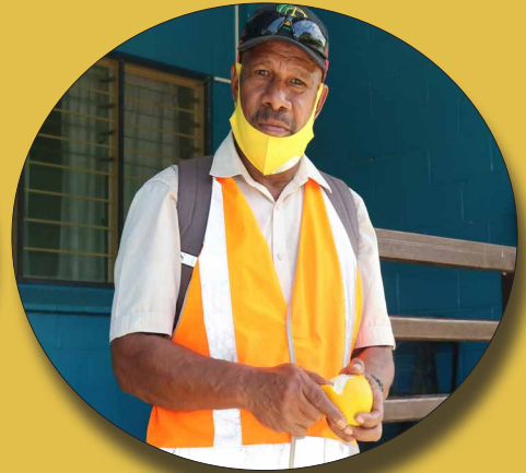
Orange man KP mero