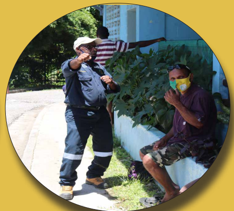
Wingman, Karate Kid part x