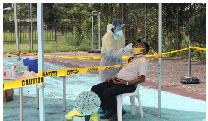
Random PCR swab test conducted at the CMCA compound

Wearing a face mask in public places, hand washing, and maintaining social distancing are mandatory preventative measures in all working areas, including community interaction.